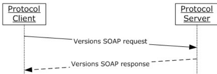
Figure 1: Versions SOAP sequence

the following figure. All SOAP requests are made to one of several well-defined URLs on the protocol server, which protocol clients can discover. The protocol server never initiates any communication with the protocol client.