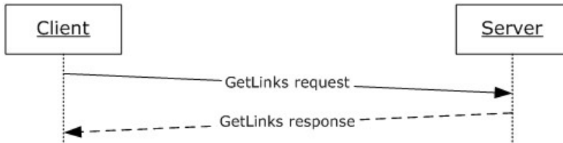
Figure 2: High-level sequence diagram for Published Links Web Service Protocol

The protocol client sends a GetLinksSoapIn request message and the protocol server MUST respond with a GetLinksSoapOut response message.