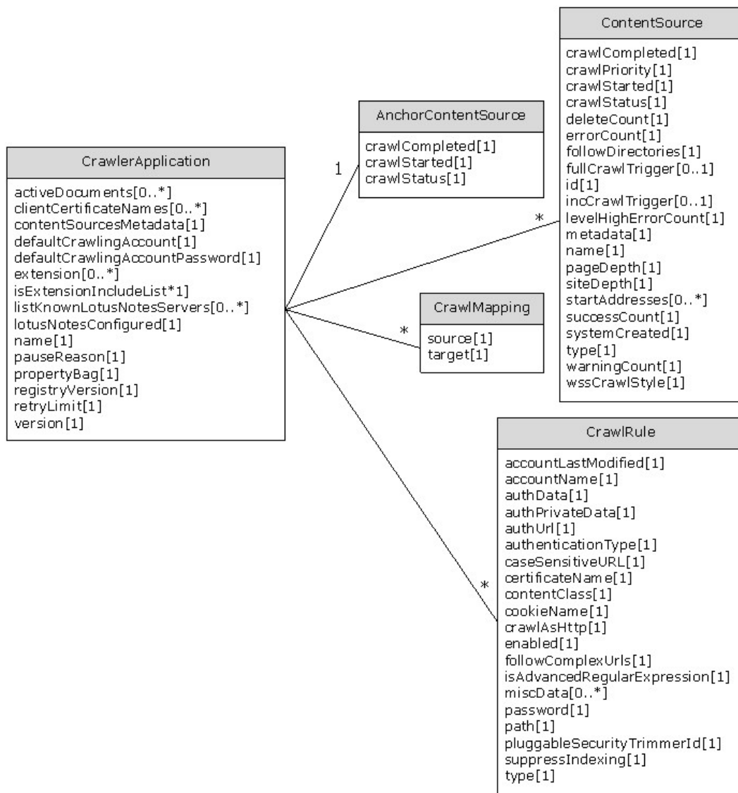
Figure 2: Object hierarchy